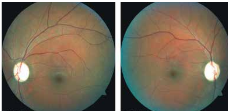
Fig. 1. Funduscopy of patient 1, showing bilateral optic atrophy and normal retinas.

His visual acuity bilaterally was 'counting fingers'. Central scotomas were noted on confrontation, but HVF showed bilateral, inferior altitudinal field defects. Colour vision was severely impaired (0/15 on Ishihara pseudo-isochromatic plates) and funduscopy revealed bilateral profound optic atrophy (Fig. 2). His pupils were reactive and a 1+ relative afferent pupillary defect was present on the right. The rest of his neurological examination was normal, and standard haematological, biochemical and CSF examination tests were normal. His CD4 + count was 615 cells/ \mu l and viral load was 27 copies/ml. MRI of the brain and orbits was normal, as was his chest radiograph. The VEP P100 wave amplitudes were reduced bilaterally. His vitamin B 12 level was mildly reduced at 117 pmol/l (normal 133 - 675), serum folate was normal and SACE was